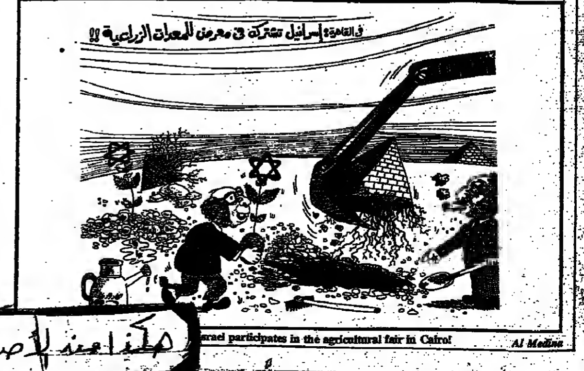
Israel participates in the agricultural fair in Cairo. Al Medina

of the region. No economy and no culture can thrive if security conditions are not available in the region itself, the paper said, and reiterated that a move toward the realization of this security should not be considered as a bloc. Instead, it takes the form of an integration that would lead to the perpetuation of internal security in the interest of the individual and the society as a whole, the paper added.